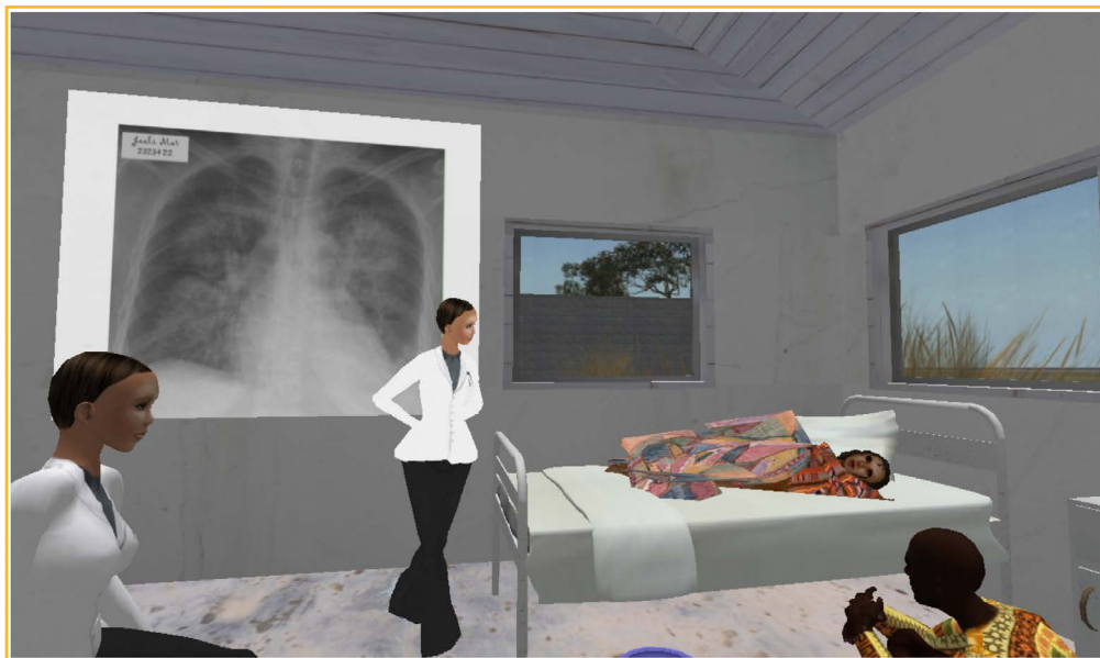
Figure 3. Global health training site.

In the public health realm, Schoonheim 44 used a virtual reality platform for public health distance education for developing nations. Though most of these studies tended to be small pilots, with limited outcomes data at this time, they demonstrated the potential and flexibility of virtual simulation in many aspects of healthcare education.