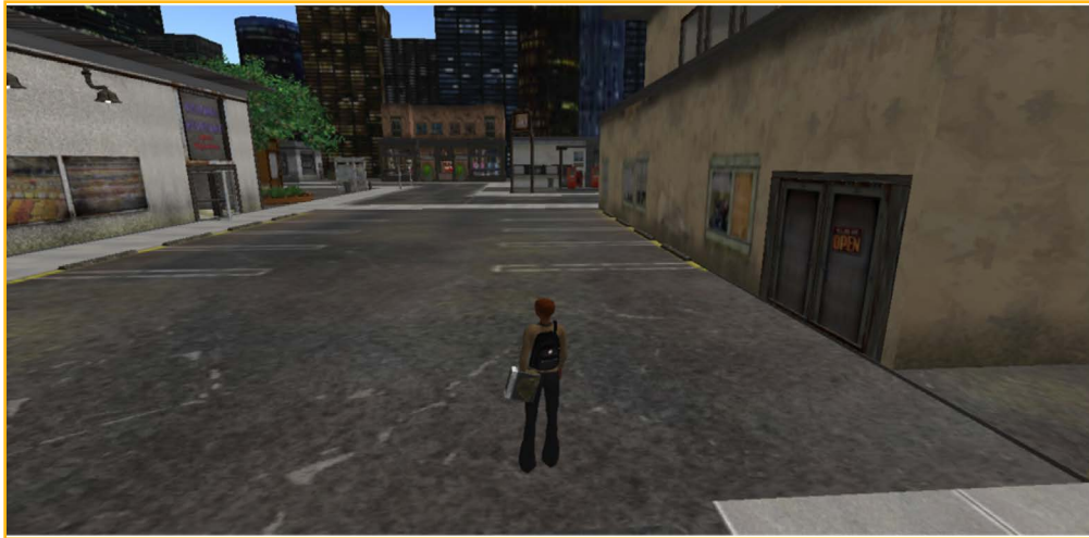
Figure 2. Urban public health setting.